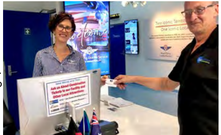
Enjoy a discounted visit to award-winning Royal Flying Doctor Service Darwin Tourism Facility. See their Seniors Card offer here .