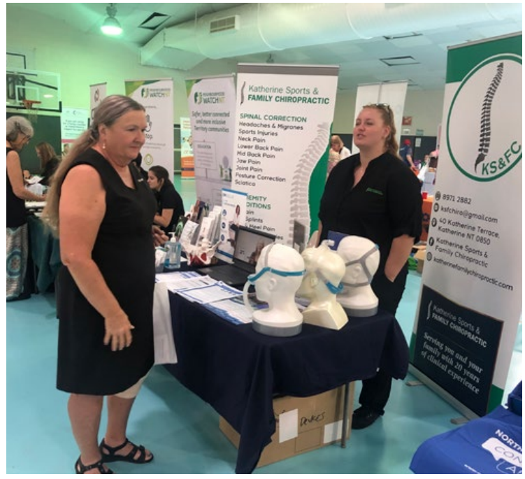
Katherine Sport & Family Chiropractic at the Katherine Seniors Expo in March